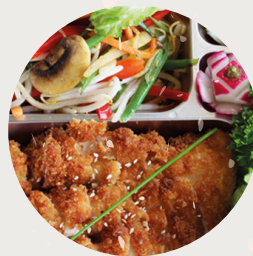
B3 TORI KATSU CURRY 咖喱鸡排