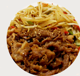
B6 BEEF CURRY 日式牛肉咖喱