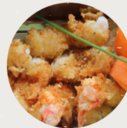
B4 EBI KATSU PRAWN 炸大虾