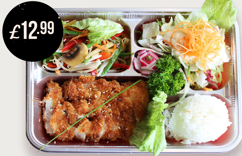
B1 TORI KATSU 炸鸡排 CHICKEN

Served with rice, salad, assorted vegetables and your main selection Bento box.